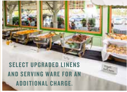
SELECT UPGRADED LINENS AND SERVING WARE FOR AN ADDITIONAL CHARGE.

With our Celebration Menu, you can choose a 2-, 3- or 4-meat item combo with non-alcoholic beverages included. Select from a variety of entrees from our delicious 'que to our famous Jambalaya "Me-Oh-My-A!"