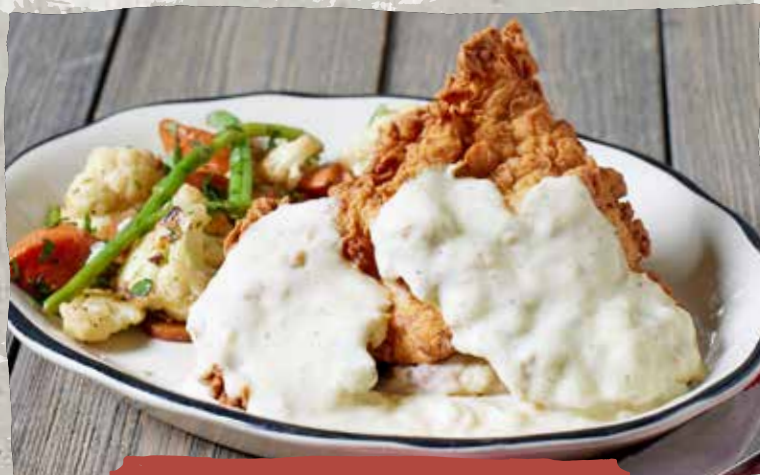
SOUTHERN FRIED CHICKEN

HOUSE SALAD 100 cal, ADD 5.99 • CAESAR SALAD 290 cal, ADD 5.99 • WEDGE SALAD 290 cal, ADD 6.99