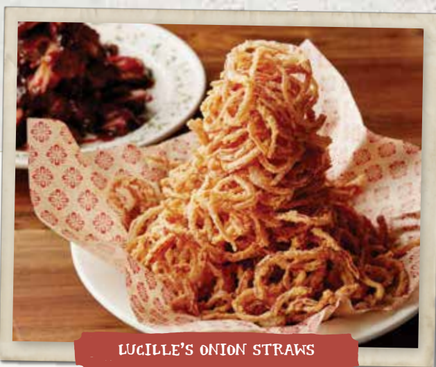
LUCILLE'S ONION STRAWS