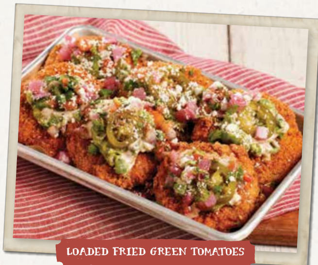
LOADED FRIED GREEN TOMATOES

Cornmeal-crust green tomatoes with housemade guacamole, spicy ranch, pico de gallo, pickled red onions, smoked jalapeños, cotija cheese and cilantro. 1270 cal 11.99