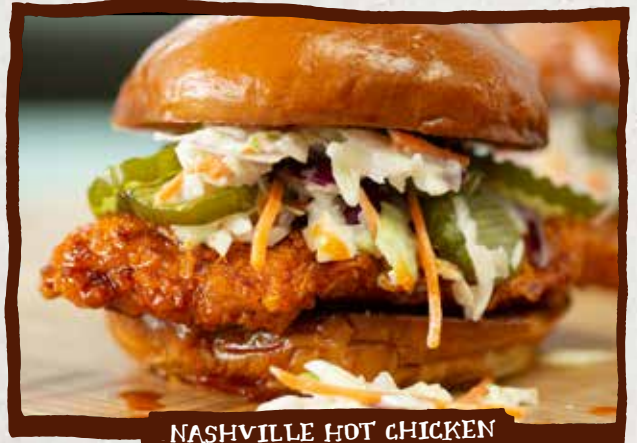
NASHVILLE HOT CHICKEN