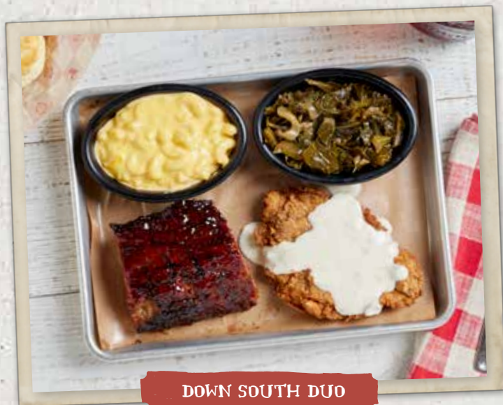
DOWN SOUTH DUO

A half pound of our special pork roast, slow-smoked until it's fork-tender, hand-shredded and tossed in our special sauce and drizzled with Memphis BBQ sauce. 510 cal 21.99