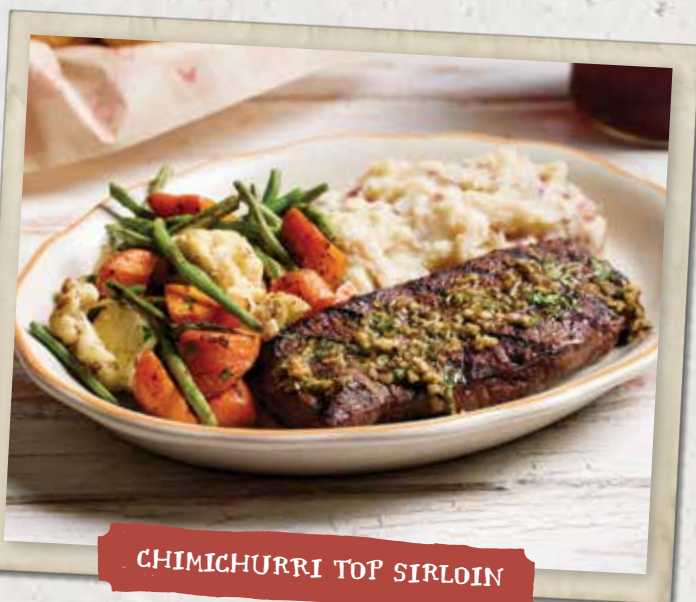
CHIMICHURRI TOP SIRLOIN