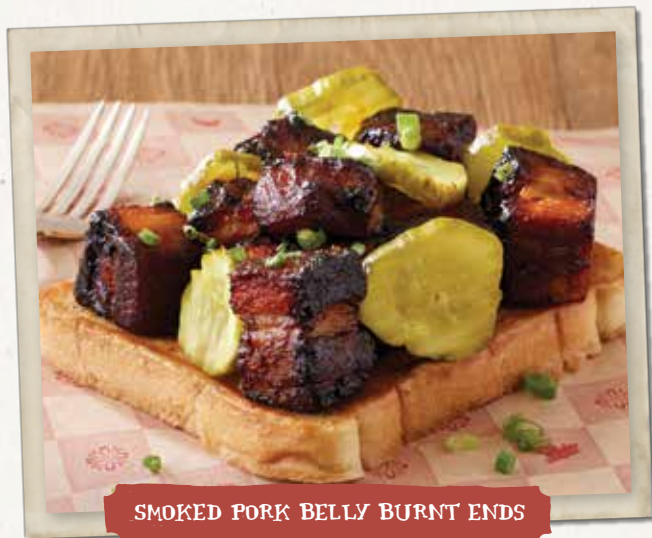
SMOKED PORK BELLY BURNT ENDS

St. Louis pork rib tips marinated in our original BBQ sauce, slowly hickory-smoked and finished on the grill. Half 770 cal 11.75 | Full 1460 cal 15.99