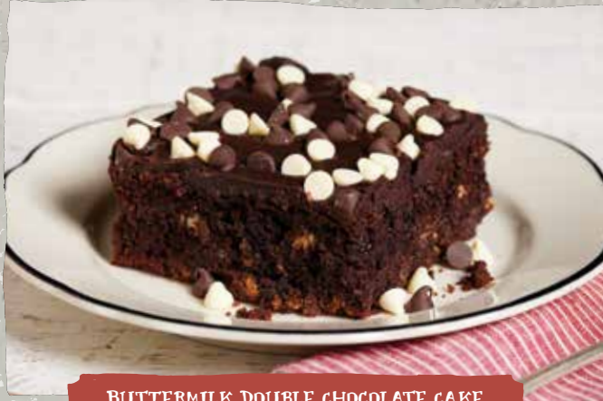
BUTTERMILK DOUBLE CHOCOLATE CAKE