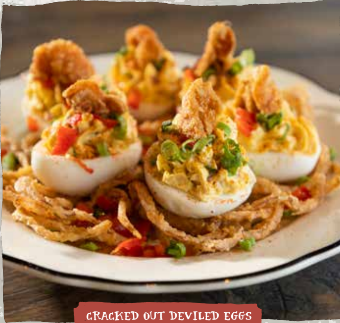
CRACKED OUT DEVILED EGGS