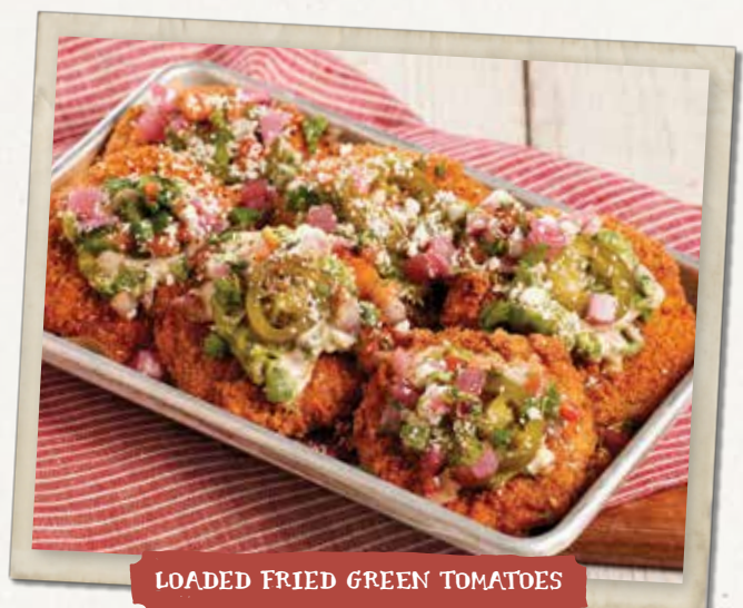
LOADED FRIED GREEN TOMATOES

Cornmeal-crust green tomatoes with housemade guacamole, spicy ranch, pico de gallo, pickled red onions, smoked jalapeños, cotija cheese and cilantro. 1270 cal 11.99