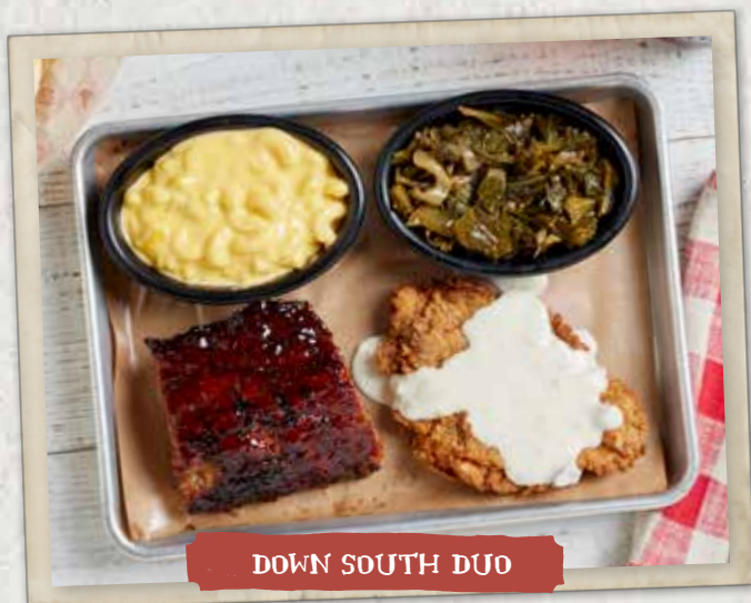
DOWN SOUTH DUO

A half pound of our special pork roast, slow-smoked until it's fork-tender, hand-shredded and tossed in our special sauce and drizzled with Memphis BBQ sauce. 510 cal 21.99