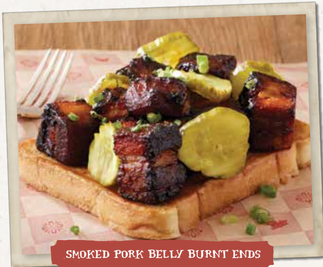
SMOKED PORK BELLY BURNT ENDS

St. Louis pork rib tips marinated in our original BBQ sauce, slowly hickory-smoked and finished on the grill. Half 770 cal 11.75 | Full 1460 cal 15.99