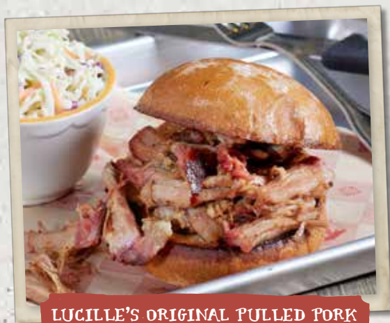
LUCILLE'S ORIGINAL PULLED PORK

Smoked chicken breast lightly grilled and topped with cheddar cheese, applewood bacon, crispy onion straws and lettuce slathered with original BBQ sauce on a grilled brioche bun. 1150 cal 16.99