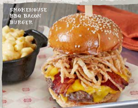
SMOKEHOUSE BBQ BACON BURGER