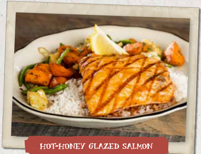
HOT-HONEY GLAZED SALMON