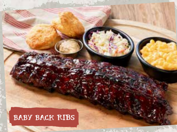
BABY BACK RIBS

✂️ WE HAND-CARVE OUR MEATS TO ORDER BECAUSE WE BELIEVE A LITTLE EXTRA CARE MAKES FOR THE MOST TENDER, SUCCULENT CUTS OF MEAT.