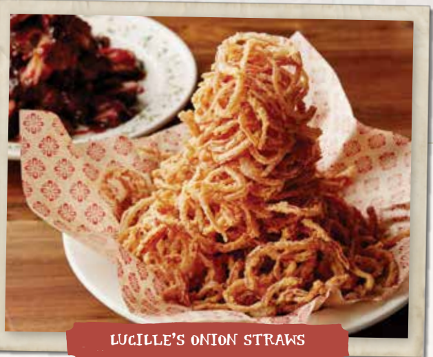
LUCILLE'S ONION STRAWS