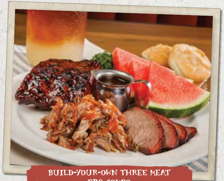
BUILD-YOUR-OWN THREE MEAT BBQ COMBO

SERVED WITH YOUR CHOICE OF ONE SWOON-WORTHY SIDE AND FRESHLY BAKED BISCUIT & APPLE BUTTER 290 cal