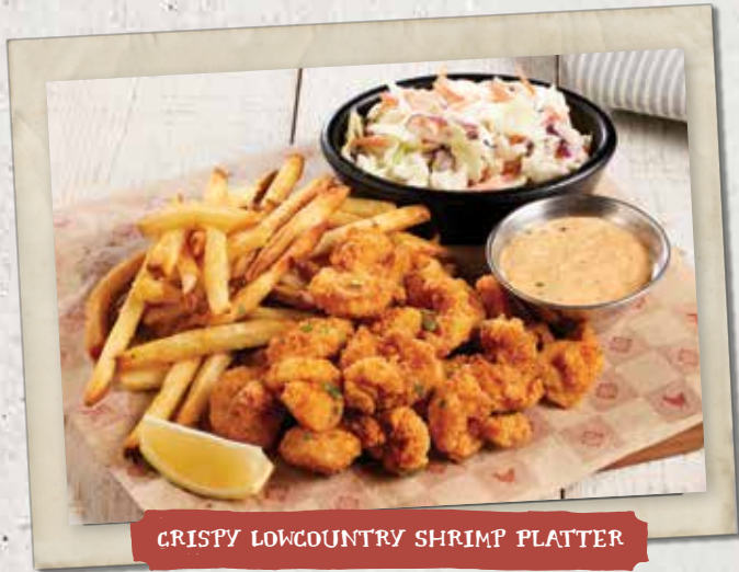
CRISPY LOWCOUNTRY SHRIMP PLATTER

HOUSE SALAD 100 cal, ADD 5.99 • CAESAR SALAD 290 cal, ADD 5.99 • WEDGE SALAD 290 cal, ADD 6.99