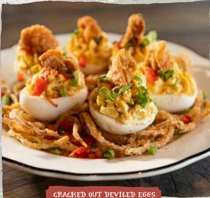
CRACKED OUT DEVEILED EGGS