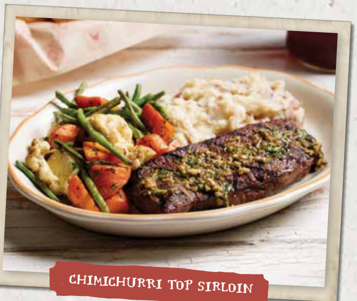
CHIMICHURRI TOP SIRLOIN

2,000 calories a day is used for general nutrition advice, but calorie needs vary. Additional nutrition information available upon request. *Consuming raw or undercooked meats, poultry, seafood, shellfish or eggs may increase your risk of foodborne illness, especially if you have certain medical conditions.