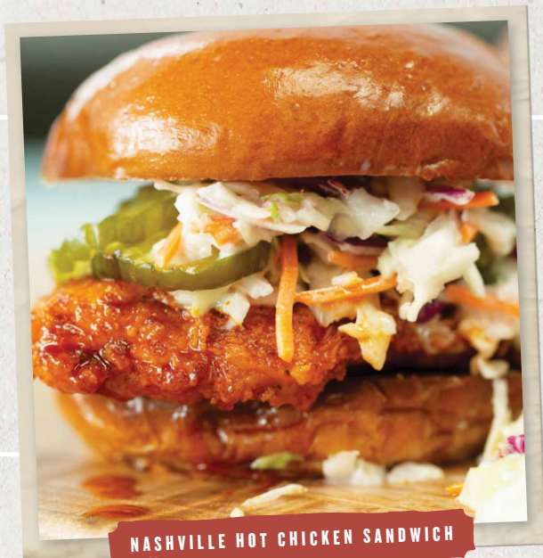
NASHVILLE HOT CHICKEN SANDWICH

MONDAY - FRIDAY • 3 P.M. - 7 P.M. • EVERY DAY • 9 P.M. - CLOSE