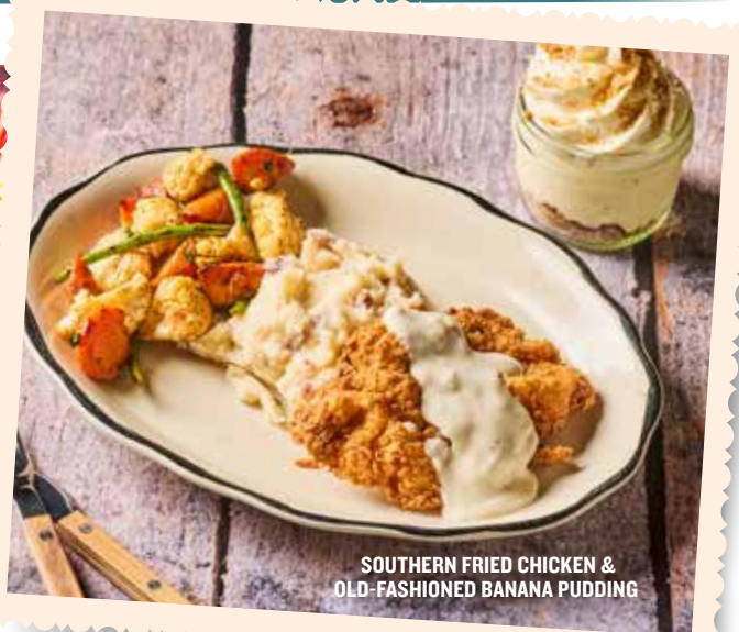
SOUTHERN FRIED CHICKEN & OLD-FASHIONED BANANA PUDDING