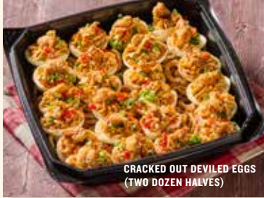
CRACKED OUT DEVILED EGGS (TWO DOZEN HALVES)