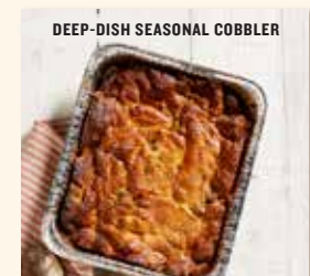
DEEP-DISH SEASONAL COBBLER