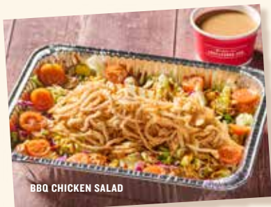
BBQ CHICKEN SALAD