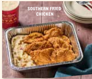
SOUTHERN FRIED CHICKEN