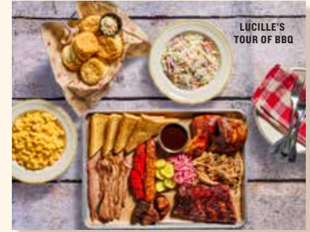
LUCILLE'S TOUR OF BBQ

† Upgrade to a Premium Side for 3.99 each.