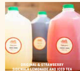
ORIGINAL & STRAWBERRY SIDEWALK LEMONADE AND ICED TEA