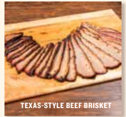
TEXAS-STYLE BEEF BRISKET