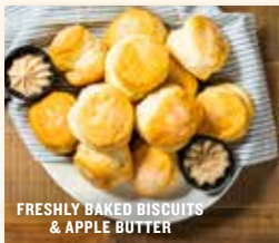
FRESHLY BAKED BISCUITS & APPLE BUTTER