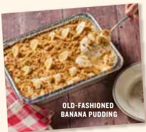
OLD-FASHIONED BANANA PUDDING

Seasonal fruit topped with a sweet caramelized butter cake. Includes whipped cream. Serves up to 16. 24 hours' notice required. 45.99