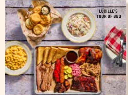
LUCILLE'S TOUR OF BBQ

† Upgrade to a Premium Side for 3.99 each.