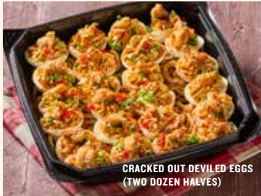
CRACKED OUT DEVILED EGGS (TWO DOZEN HALVES)