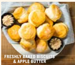
FRESHLY BAKED BISCUITS & APPLE BUTTER